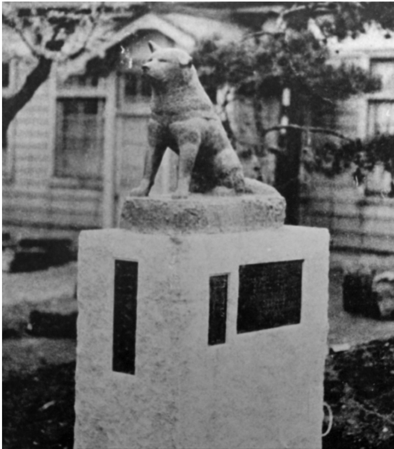
Photo Left: Perkins School for the Blind Archives Photo Right: Odate city, Akita prefecture